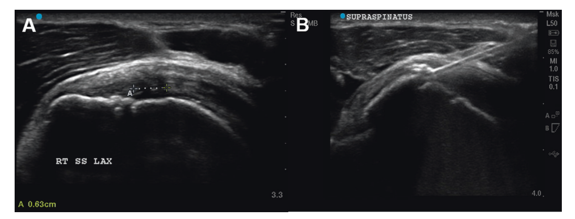
Fig. 2 Long Axis image of 0.63 cm articular sided tear, partial thickness tear of the supraspinatus tendon a . Long Axis image of MFAT being injected, using an in-plane approach, into the supraspinatus partial-thickness tendon tear b

articular surface insertional tear of the anterior infraspinatus and posterior supraspinatus tendons 12 months post-treatment ( b )